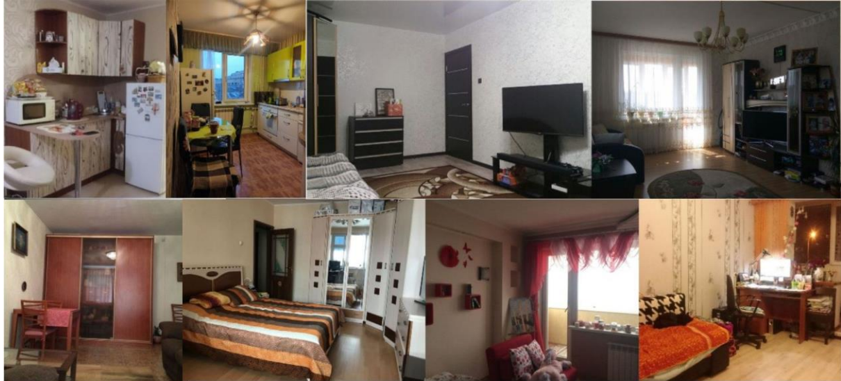
Figure 2. Modern interiors of a mainstream city resident.

tablecloths, crystal glassware and wooden souvenirs which used to prevail in Soviet interiors (Figure 2).