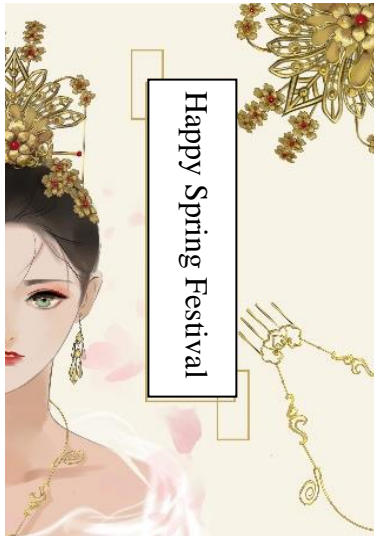
Fig. 2. Art Poster. Author Yang Yipeng.

At the level of intercultural interaction, objects of modern art, environment, textile design and costume design are considered as creative sources of regional design. Textile paintings (as examples of recycling of textile materials) and costume design are objects of ecological design in a regional space. Entry into the era of eco-design is to design objects without surplus materials, in the pursuit of reuse of clothing and textile fiber waste, thereby reinforcing the lifecycle and value of products, whether it is the awakening of designers and brands, or the real life needs of the people. Actual trends in the fashion industry are aimed at shaping the social responsibility of each industry in environmental protection. The fashion industry in recent years has demonstrated a global impact on all aspects of life and diverse values, and also plays a leading role in shaping effective consumer behavior patterns [3].