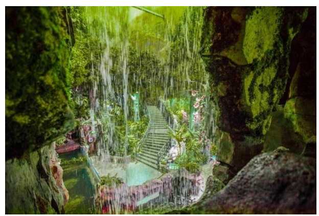
Figure 8. "Tropical Rain Forest" in the Primorsky Oceanarium. Available from: http://primocean.ru/news/anons.html [Accessed 9th august 2019].