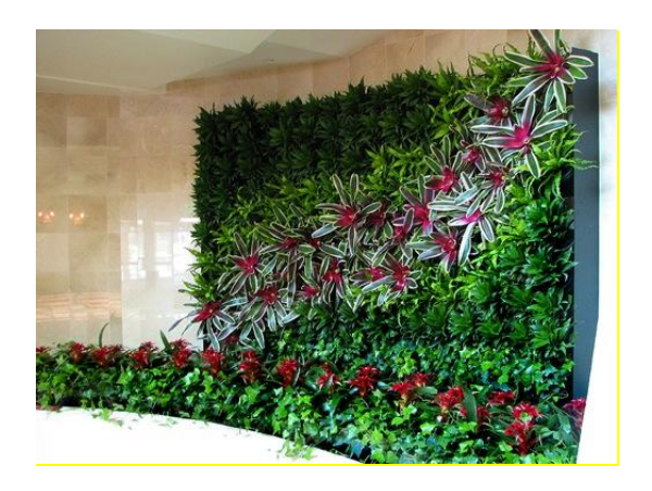
Figure 7. The project "BIBILOK" company (BB Lock). Available from: http://vin-st.com/ [Accessed 9th august 2019].

At the same time, there are few objects in the city based on federal funding. For example, part of the exposition "Tropical Rain Forest" in the Primorsky Oceanarium (Figure 8). This is one of the most striking and large-scale examples of vertical gardening in the Vladivostok at the moment. We can see the stylistic homogeneity and compositional integrity of this design.