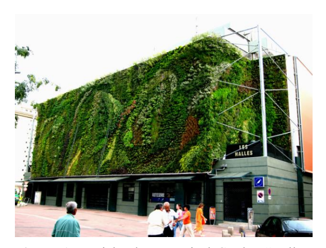
Figure 1. Patrick Blanc Vertical Garden "Halles Avignon", Provence, French Riviera, 2005. Available from:

https://www.verticalgardenpatrickblanc.com/node /1307 [Accessed 9th august 2019].