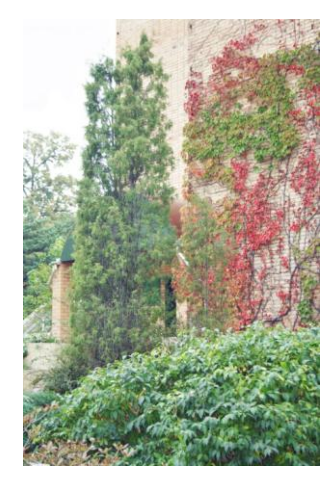
Figures 5-6. Lianas on the main building facade of the Botanical Garden-Institute of the Far Eastern Branch of the Russian Academy of Sciences (Vladivostok) Available from: https://www.maam.ru/detskijsad/botanicheskii-sad-vo-vladivostoke-oktjabr-2015-g-fotoyekskursija.html [Accessed 9th august 2019].