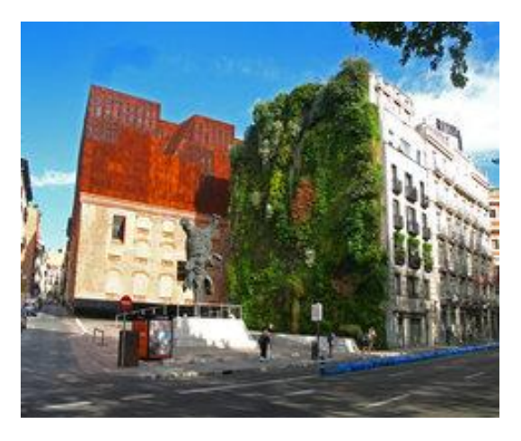
Figure 2. Patrick Blanc Vertical Garden "Caixa Forum", Architectors: Herzog & de Meuron, Madrid, 2007. Available from:

https://www.verticalgardenpatrickblanc.com/node /1307 [Accessed 9th august 2019].