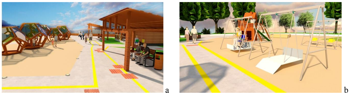
Figure 2. Examples of project proposals for Kungasniy beach: a – recreation area; b – playground

The project proposals of all listed facilities also include safe and affordable sanitation facilities; lighting; graphical support in the form of signs and markings; comfortable walking surface; elements of geoplastics for games and rest; sports grounds and recreation areas.